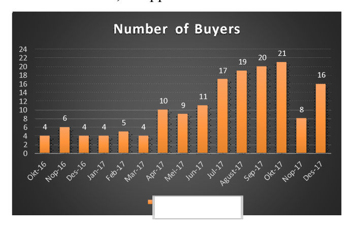
Figure 2. Graph of Buyer Amount Kedai Karya Online Shop

Facebook, Instagram, as well as on Tokopedia e-commerce site, Shoppe.