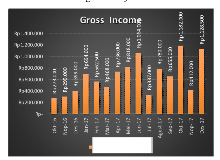
Figure 3. Gross Revenue Chart of Kedai Karya Online Shop

The second factor is in Eid Al-Fitr, Christmas, and Lunar times the number of flannel character envelope orders increases. The third factor is cactus plants are interested buyers with the number of orders coming to Kedai Karya Online Shop. This can be proven by the income statement in July 2017 to December 2017 there is always a Cactus plant order. The number of buyers in Kedai Karya Online Shop also affects the Gross Income per month. This can be seen in Figure 3 on the Gross Revenue Chart of Kedai Karya Online Shop starting from October 2016 to December 2017. In June 2017, October 2017 and December 2017 gross income increased significantly.